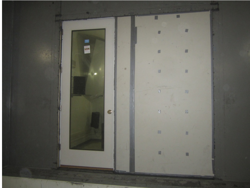
Receive Room View of Installed Specimen