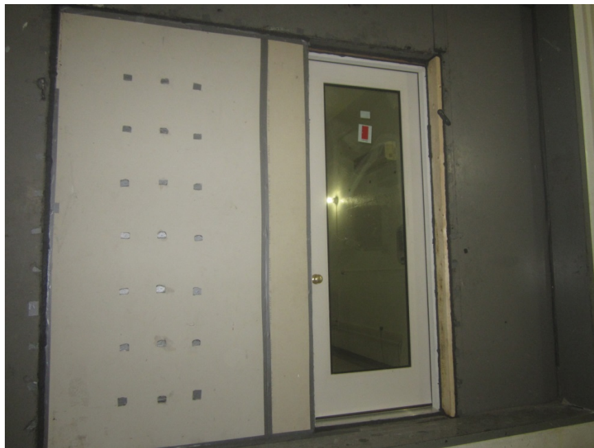
Source Room View of Installed Specimen