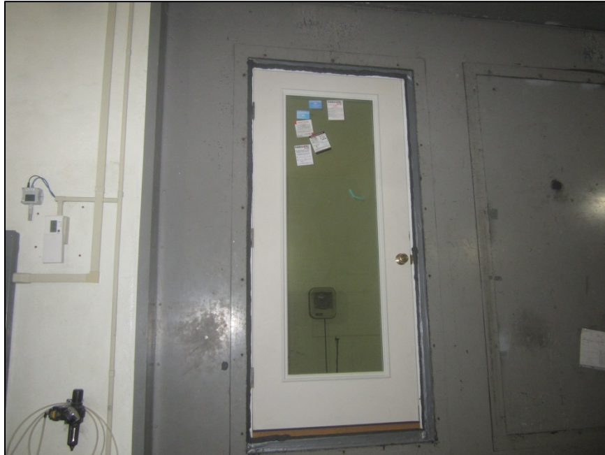
Receive Room View of Installed Specimen